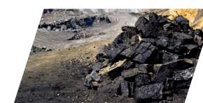
Quarrying & Mining